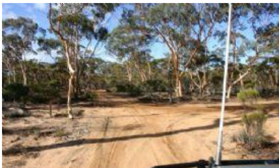
View of turnoff to Thursday Rock travelling northbound on the Holland Track