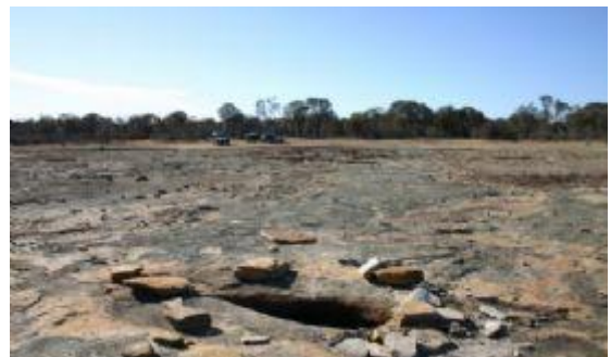
Numerous gnamma holes on Holland Rocks