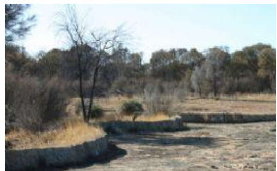
Ingenious methods used by pioneers to channel natural water for collection