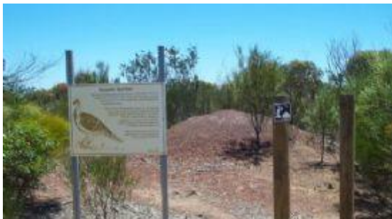
Mallee Fowl's nest

Holland Memorial Park Holland Tank Holland Rocks Silver Wattle Hill Reserve Commemorative Plaques Lake Bidy Historic Site Sandplain Rocks Dragon Rocks Emu Rock State Barrier Fence Holland Track Information Signboard Mallee Fowls Nest Mt Holland Sandalwood Rocks Visitors Book Newbey Rock Krakouer Rock Agnes Gnamma Hole Diamond Rock Thursday Rock Pigeon Hole Victoria Rock Gnarlbine Rock Coolgardie