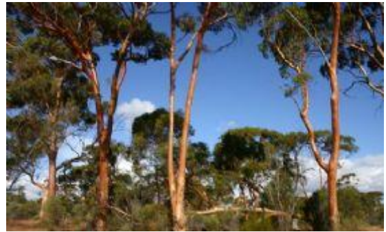
Beautiful gum trees at Thursday Rock - a great site for camping