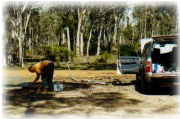
Picnic spots in the Wandoo Woodlands

Bushland, convict ruins, bush camps, St Ronans Well