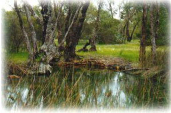
St Ronans Well - just west of York